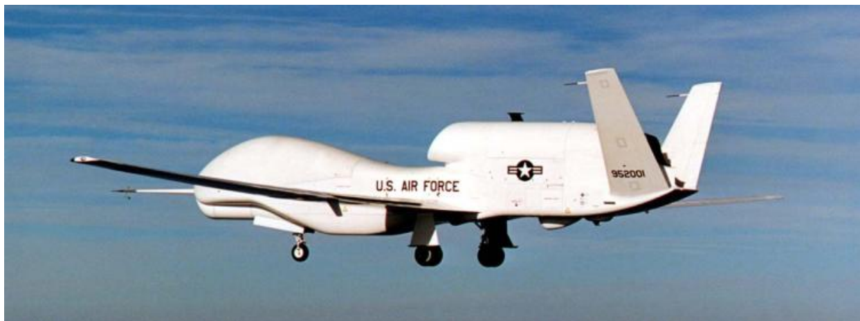
Figure 4: RQ-4A Global Hawk UAV

As previously mentioned, the MQ-9 Reaper is a larger, more capable version of the Predator. Also built by General Atomics, the Reaper was previously known as the Predator B. The Reaper is 36 feet long with a 66 foot wingspan, and is powered by a Honeywell TPE-331 turboprop engine developing 900 horsepower. The Reaper's weapon load is ten times that of the Predator, capable of carrying up to 3,000 pounds on six underwing hardpoints. With the same endurance as Predator, the Air Force has categorized the Reaper as a "hunter-killer" aircraft -- the attack mission takes precedence over the reconnaissance mission. The Air Force formed the 42nd Attack Squadron at Creech Air Force Base in 2006, the first Reaper unit, and plans to buy up to 70 MQ-9s by 2009. 31