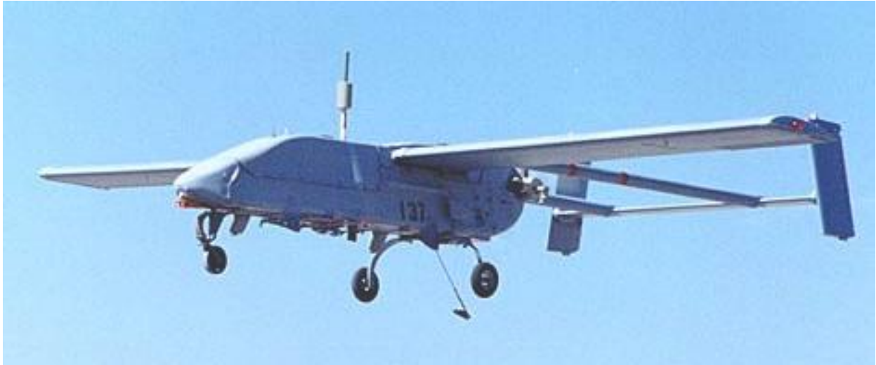
Figure 1: RQ-2A Pioneer UAV