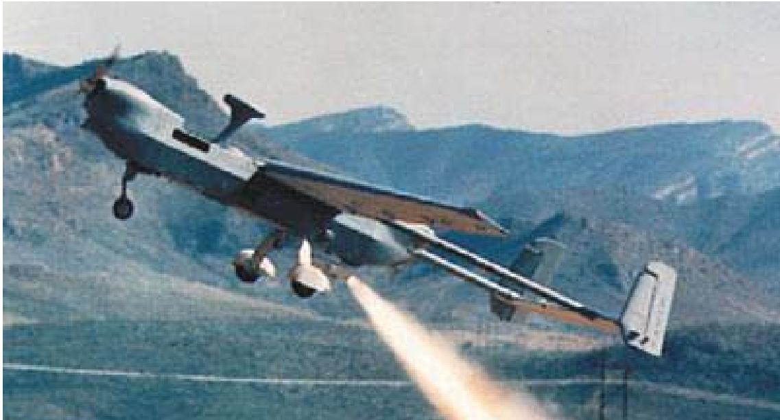
Figure 2: RQ-5A Hunter UAV

Scout") have forced the venerable and still quite capable Pioneer to soldier on with the Navy and Marine Corps. 26